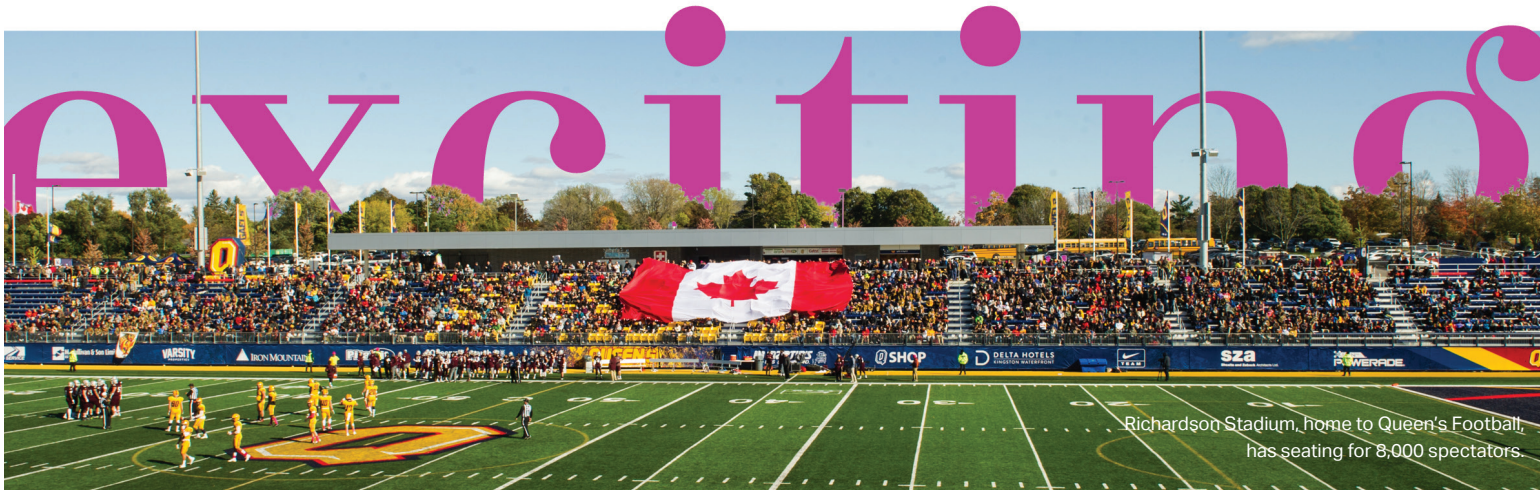
Richardson Stadium, home to Queen's Football, has seating for 8,000 spectators.

Kingston features more than 50 sports fields, from stadiums and large multiplexes to neighbourhood fields.