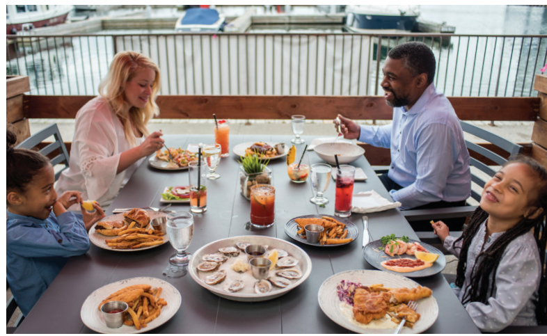
Kingston offers a huge variety of dining options for your group.