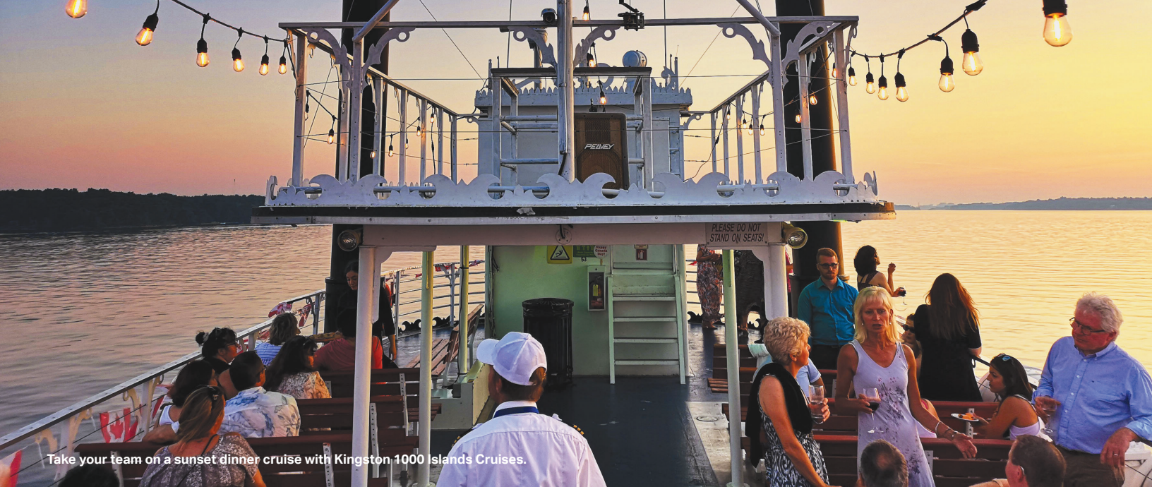
Take your team on a sunset dinner cruise with Kingston 1000 Islands Cruises.