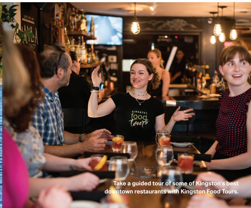
Take a guided tour of some of Kingston's best downtown restaurants with Kingston Food Tours.