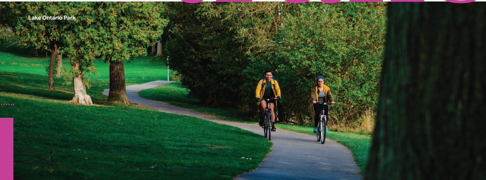
Lake Ontario Park