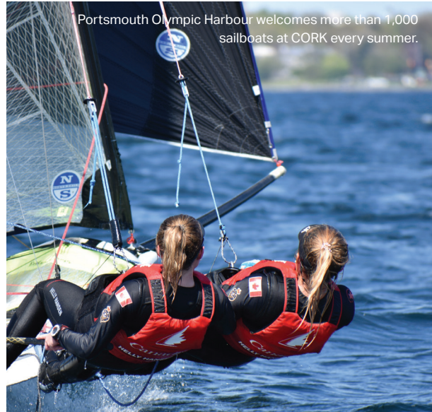
Portsmouth Olympic Harbour welcomes more than 1,000 sailboats at CORK every summer.

Built as the sailing venue for the 1976 Summer Olympics, Portsmouth Olympic Harbour hosts provincial, national, and international sailing events. Every year, Kingston plays host to more than 1,000 sail boats during the annual CORK regattas. The facility features 250 slip finger docks, large meeting and event rooms, and secure storage areas.