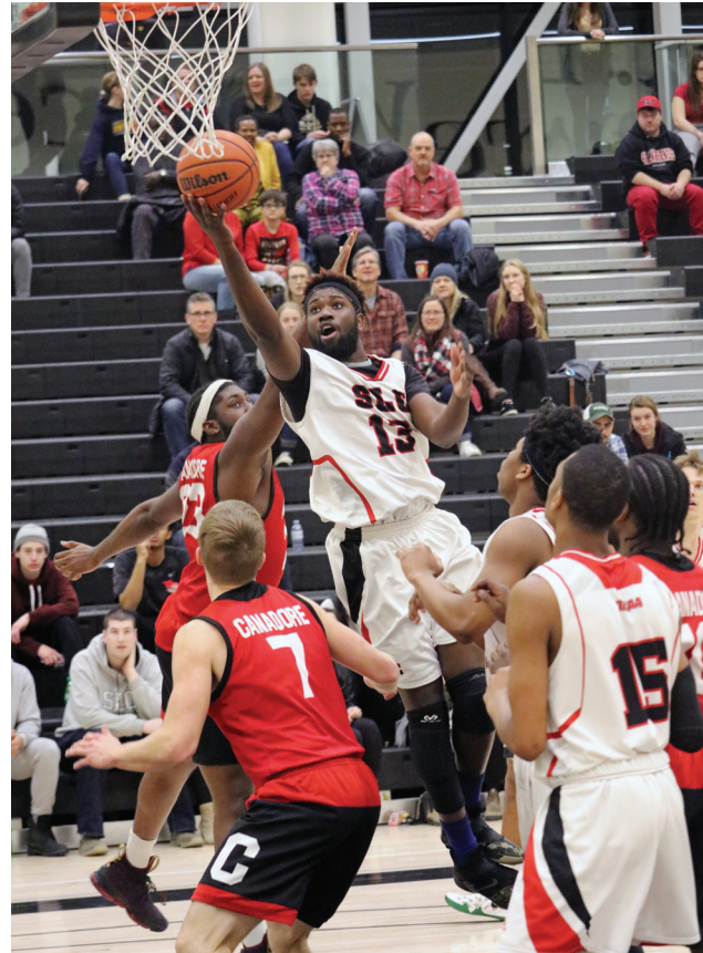
The college's Student Life and Innovation Centre features a double gymnasium, fitness centre, and meeting space.

St. Lawrence College offers 306 guestrooms (147 are double-occupancy) from May to the end of August.