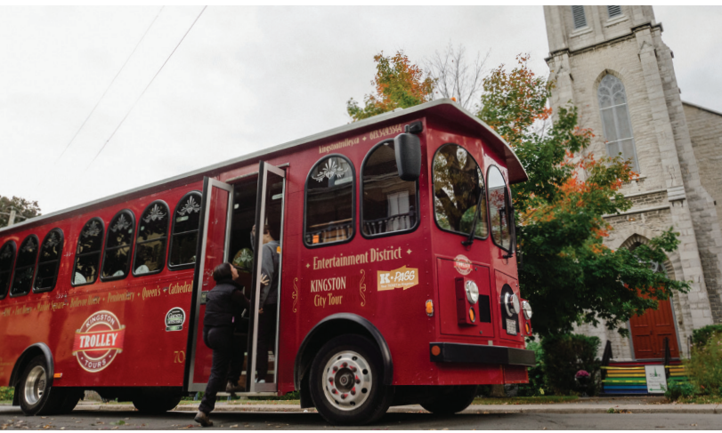
Take a guided trolley tour through Kingston and learn about the community's history.