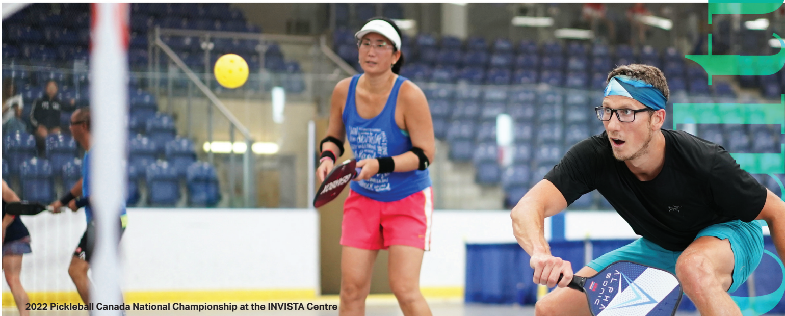
2022 Pickleball Canada National Championship at the INVISTA Centre

Kingston offers a number of dedicated pickleball courts as well as tennis courts lined for pickleball. Kingston hosted the Eastern Canadian Regional Pickleball Championships in 2017 and 2018 and the Pickleball Canada National Championship in 2019 and 2022 at the INVISTA Centre.