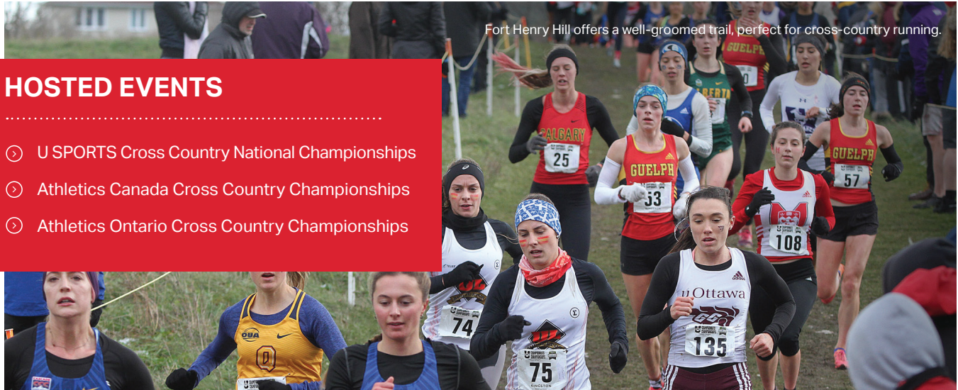
Fort Henry Hill offers a well-groomed trail, perfect for cross-country running.

A UNESCO World Heritage Site, Fort Henry is also a specialized facility for cross-country running. Fort Henry Hill is a well-groomed trail overlooking Fort Henry, Royal Military College, and the city of Kingston. The racecourse is 2.5 km in length, with small rolling, grass-covered hills.