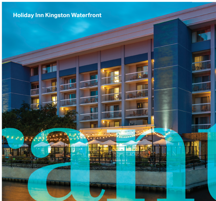
Holiday Inn Kingston Waterfront

Let Tourism Kingston help you find the perfect accommodation for your group. We will assist with site tours, RFPs, and negotiations. We will secure the best rate for you. Our dedicated Business Events Specialist can also help you find meeting spaces for your group, for strategic plannings, AGMs, technical meetings, or coaches' conferences.