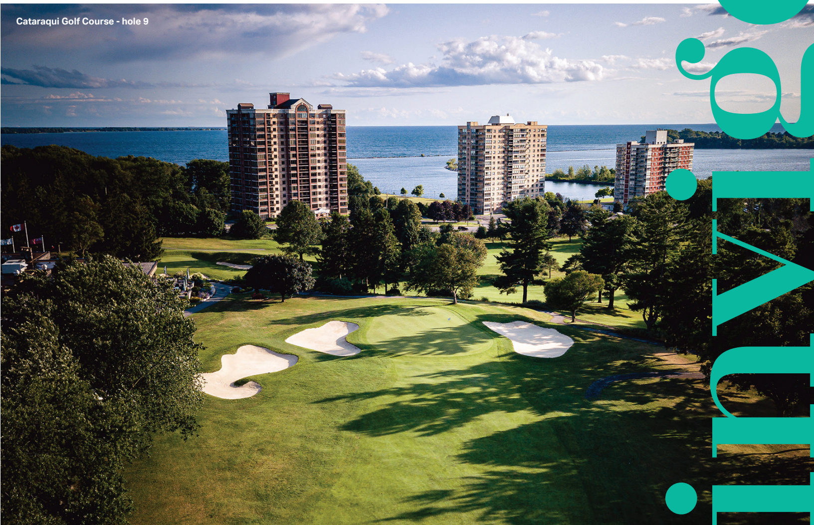
Cataraqi Golf Course - hole 9