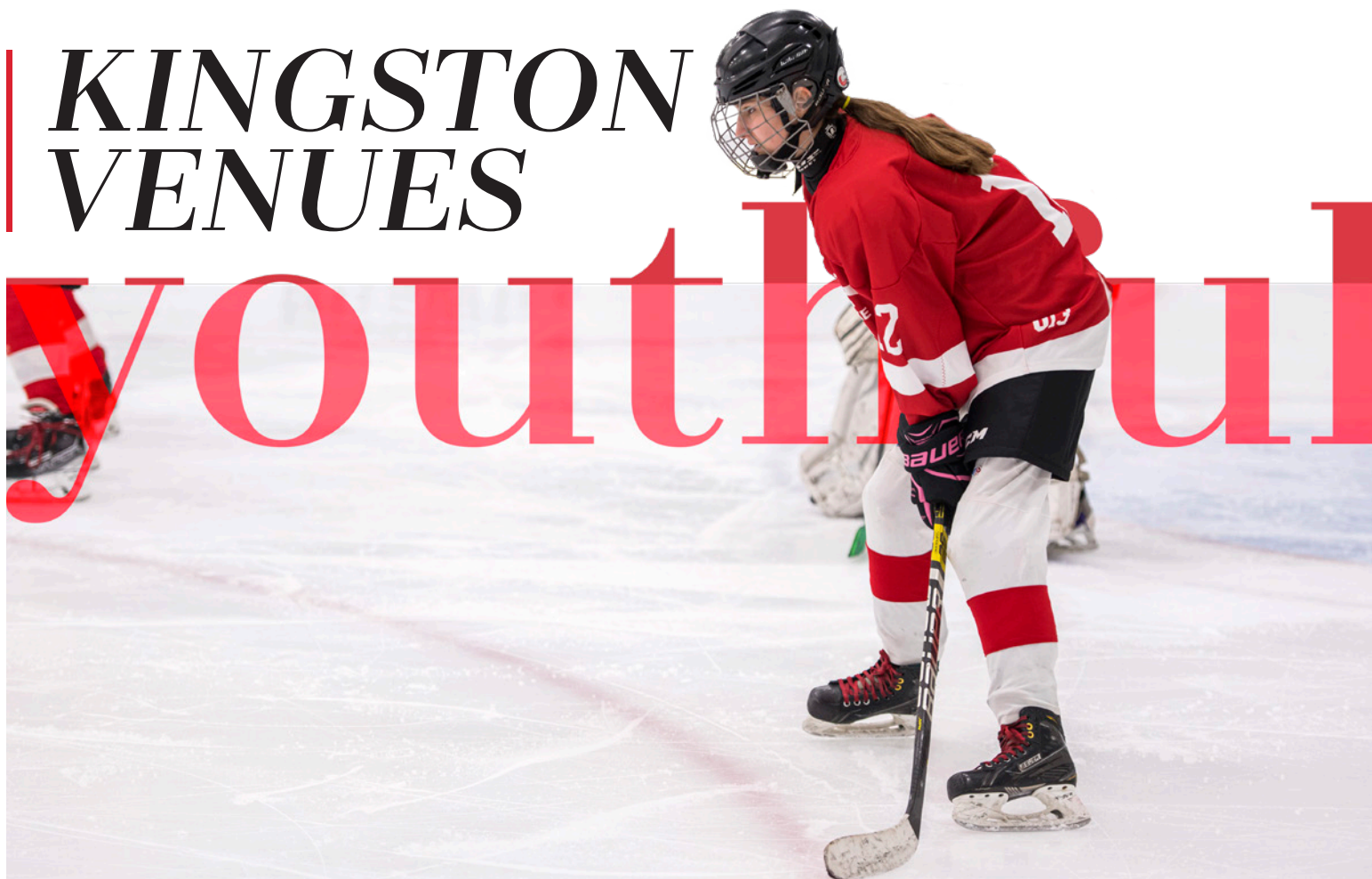
The INVISTA Centre welcomed the 2023 Kids for Kids hockey tournament.