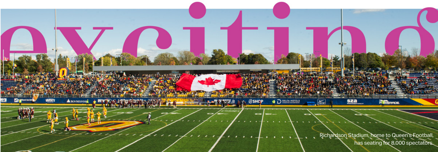
Richardson Stadium, home to Queen's Football, has seating for 8,000 spectators.

Kingston features more than 50 sports fields, from stadiums and large multiplexes to neighbourhood fields.