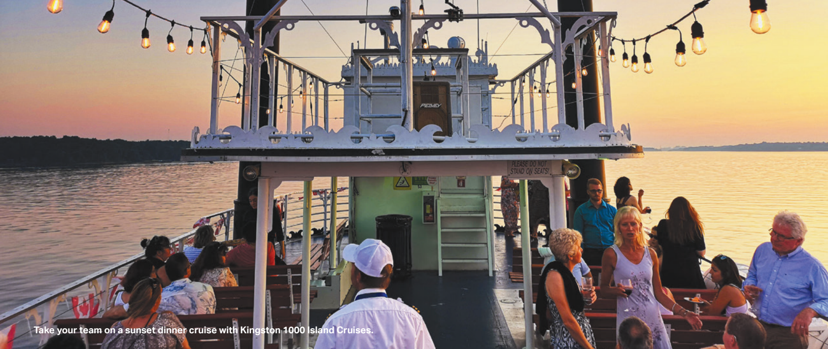
Take your team on a sunset dinner cruise with Kingston 1000 Island Cruises.