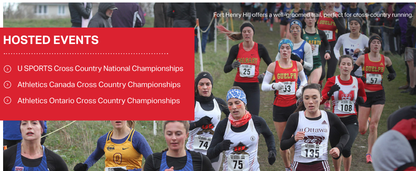
Fort Henry Hill offers a well-groomed trail, perfect for cross-country running.

A UNESCO World Heritage Site, Fort Henry is also a specialized facility for cross-country running. Fort Henry Hill is a well-groomed trail overlooking Fort Henry, Royal Military College, and the city of Kingston. The racecourse is 2.5km in length, with small rolling, grass-covered hills.