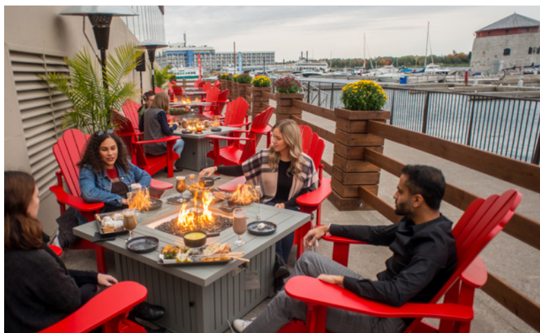
Kingston offers a huge variety of dining options for your group.