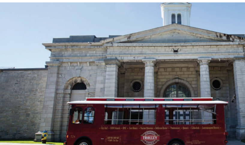
Take a guided trolley tour through Kingston and learn about the community's history.