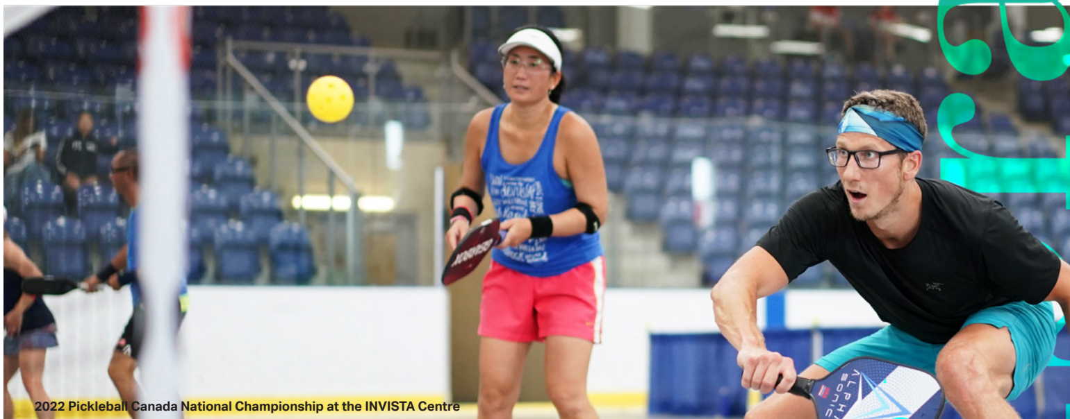
2022 Pickleball Canada National Championship at the INVISTA Centre

Kingston offers a number of dedicated pickleball courts as well as tennis courts lined for pickleball. Kingston hosted the Eastern Canadian Regional Pickleball Championships in 2017 and 2018 and the Pickleball Canada National Championship in 2019 and 2022 at the INVISTA Centre.