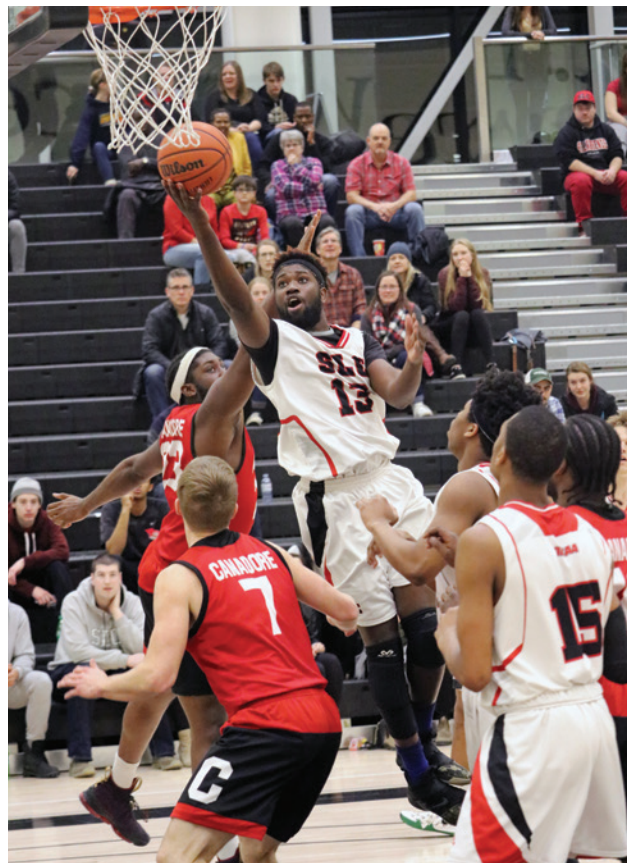
The college's Student Life and Innovation Centre features a double gymnasium, fitness centre, and meeting space.

St. Lawrence College offers 306 guestrooms (147 are double-occupancy) from May to the end of August.