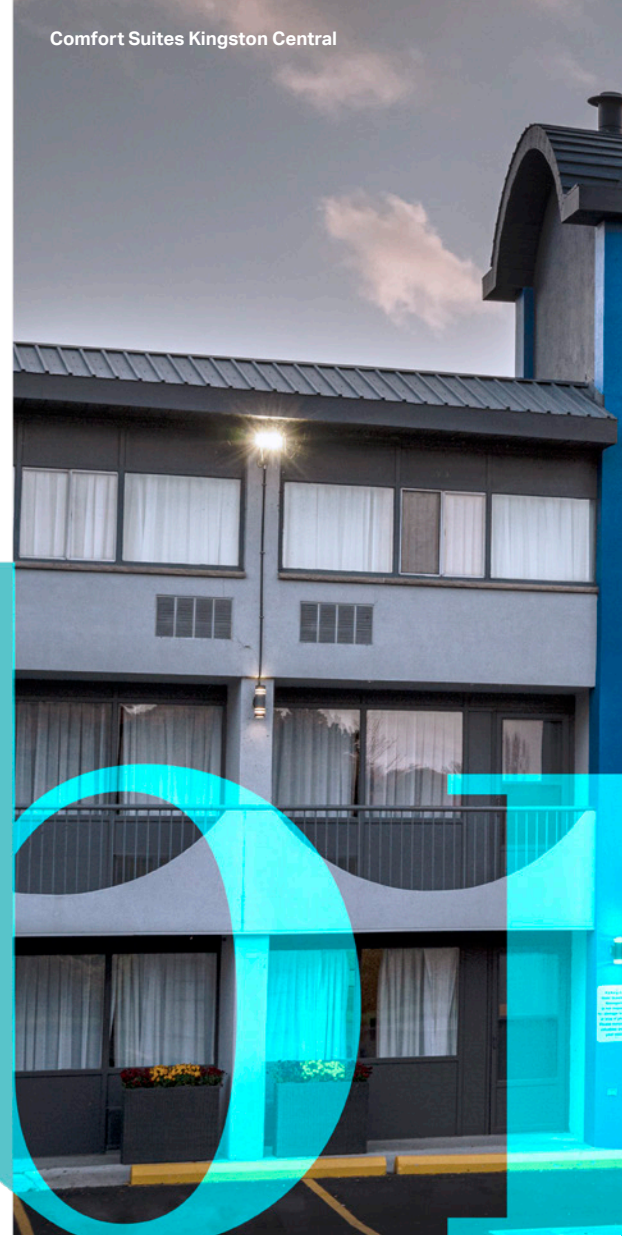
Comfort Suites Kingston Central