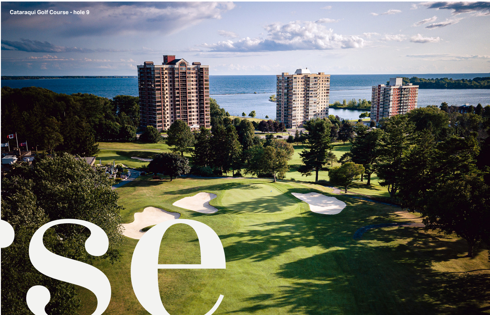
Cataraqi Golf Course - hole 9