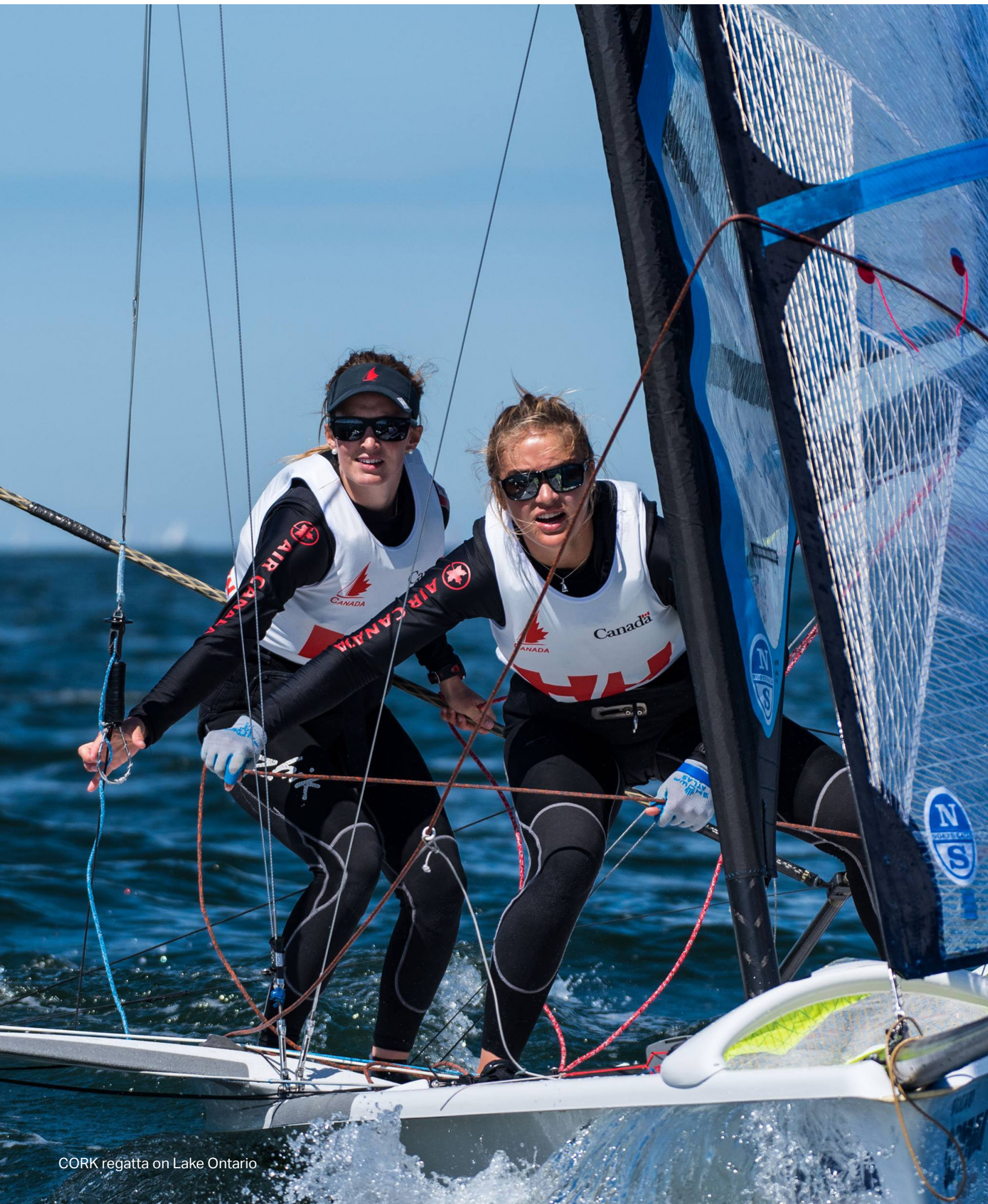
CORK regatta on Lake Ontario