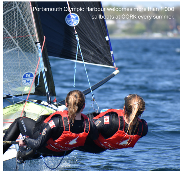
Portsmouth Olympic Harbour welcomes more than 1,000 sailboats at CORK every summer.

Built as the sailing venue for the 1976 Summer Olympics, Portsmouth Olympic Harbour hosts provincial, national, and international sailing events. Every year, Kingston plays host to more than 1,000 sail boats during the annual Canadian Olympic Regatta Kingston (CORK). The facility features 250 slip finger docks, large meeting and event rooms, and secure storage areas.