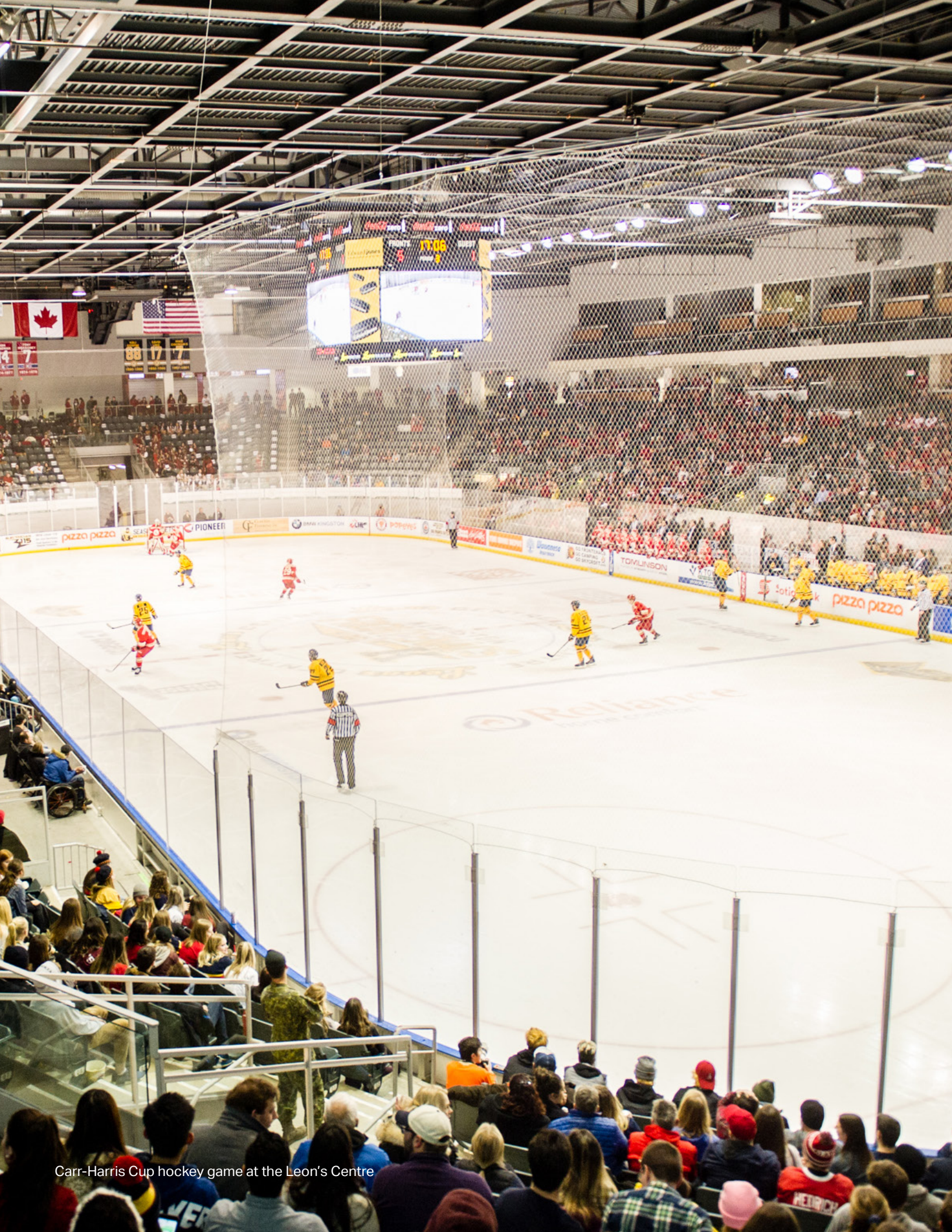
Carr-Harris Cup hockey game at the Leon's Centre