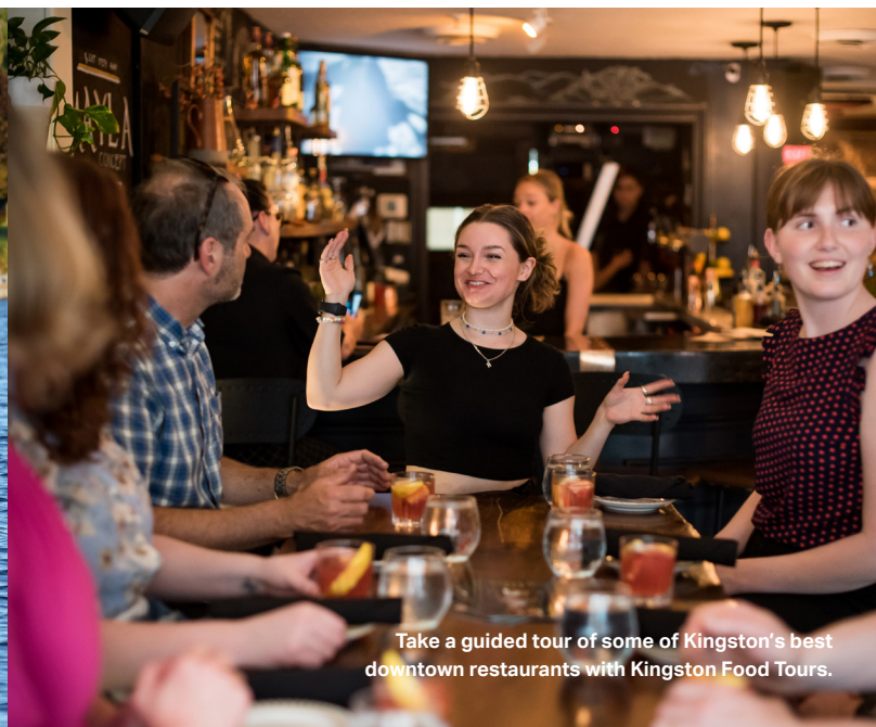
Take a guided tour of some of Kingston's best downtown restaurants with Kingston Food Tours.