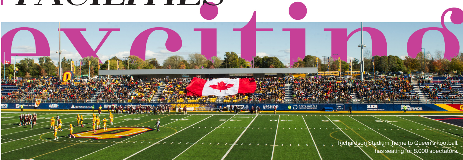
Richardson Stadium, home to Queen's Football, has seating for 8,000 spectators.

Kingston features more than 50 sports fields, from stadiums and large multiplexes to neighbourhood fields.