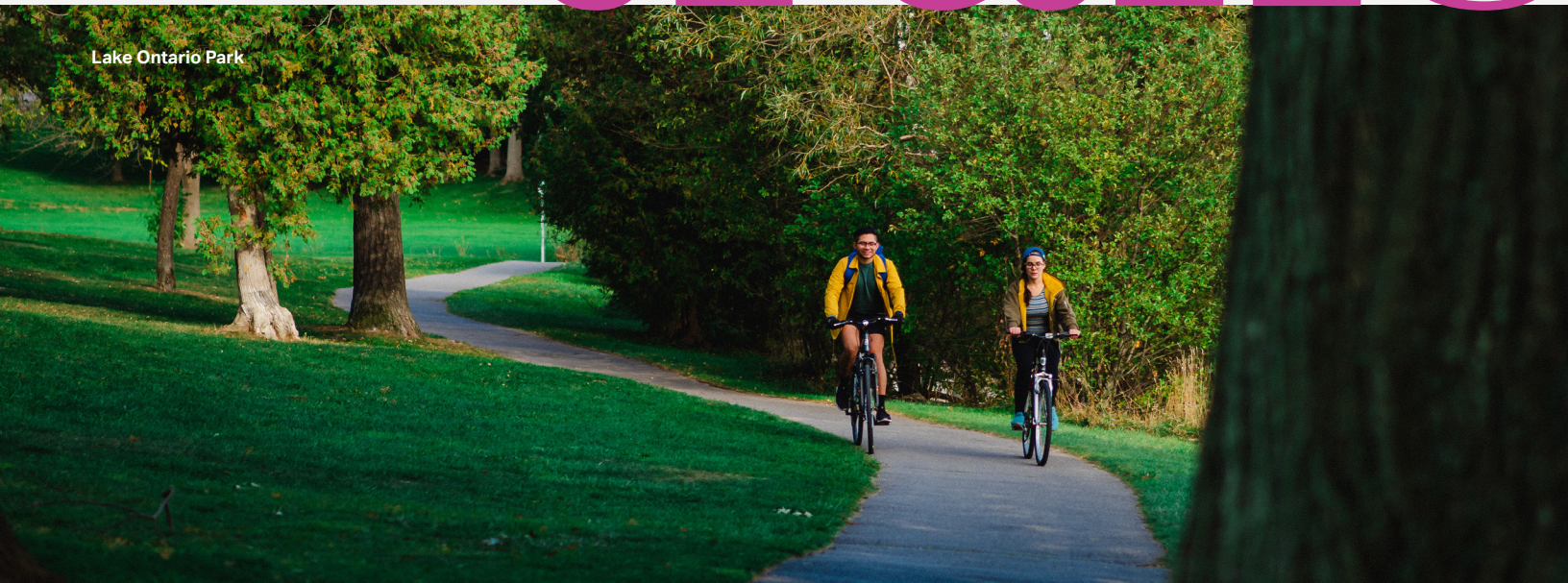
Lake Ontario Park