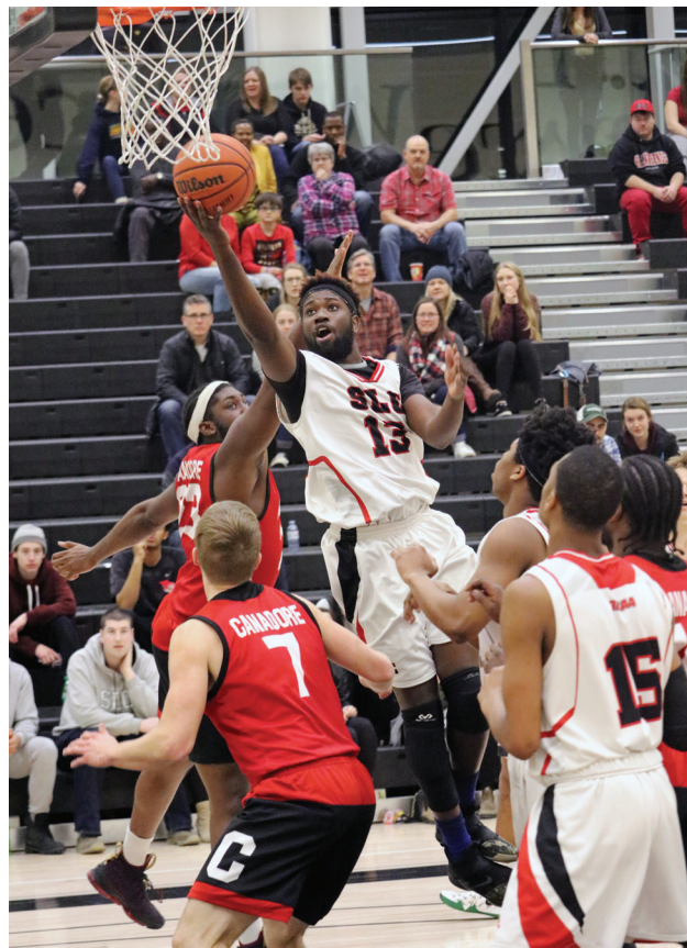
The college's Student Life and Innovation Centre features a double gymnasium, fitness centre, and meeting space.

St. Lawrence College offers 306 guestrooms (147 are double-occupancy) from May to the end of August.