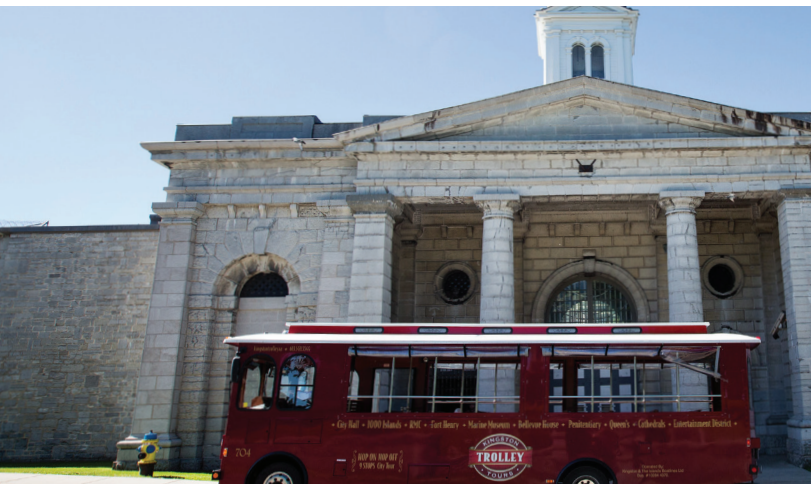
Take a guided trolley tour through Kingston and learn about the community's history.