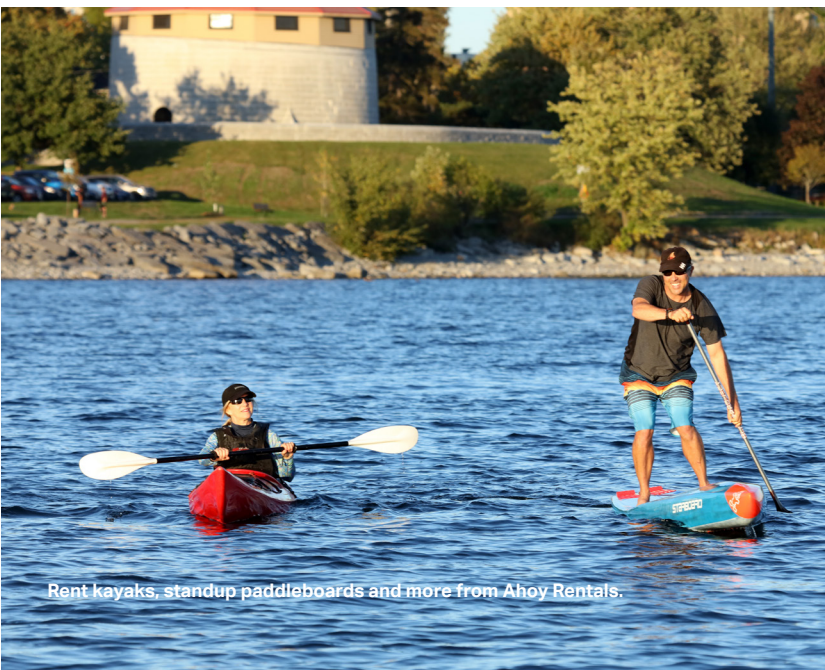
Rent kayaks, standup paddleboards and more from Ahoy Rentals.