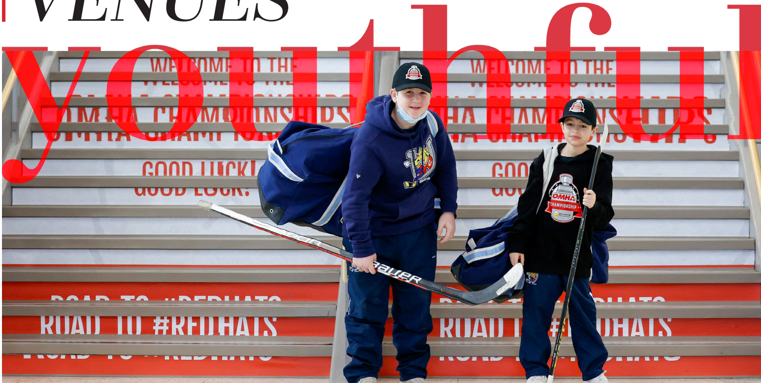
The INVISTA Centre welcomed the 2022 OMHA championship finals.