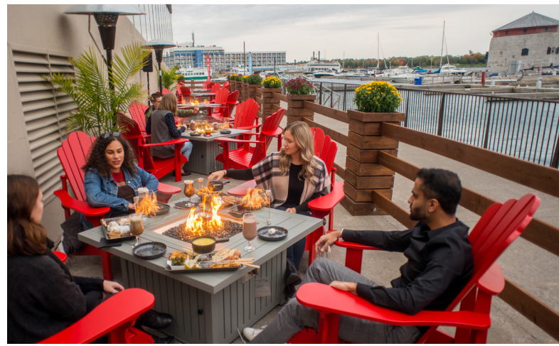
Kingston offers a huge variety of dining options for your group.