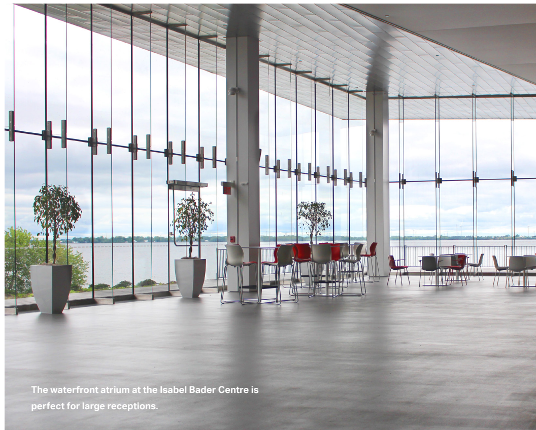
The waterfront atrium at the Isabel Bader Centre is perfect for large receptions.