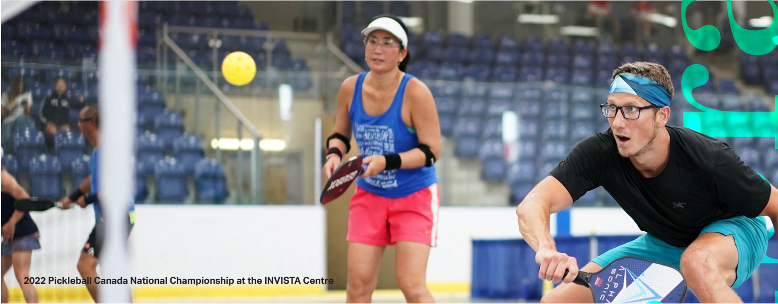
2022 Pickleball Canada National Championship at the INVISTA Centre

Kingston offers a number of dedicated pickleball courts as well as tennis courts lined for pickleball. Kingston hosted the Eastern Canadian Regional Pickleball Championships in 2017 and 2018 and the Pickleball Canada National Championship in 2019 and 2022 at the INVISTA Centre.