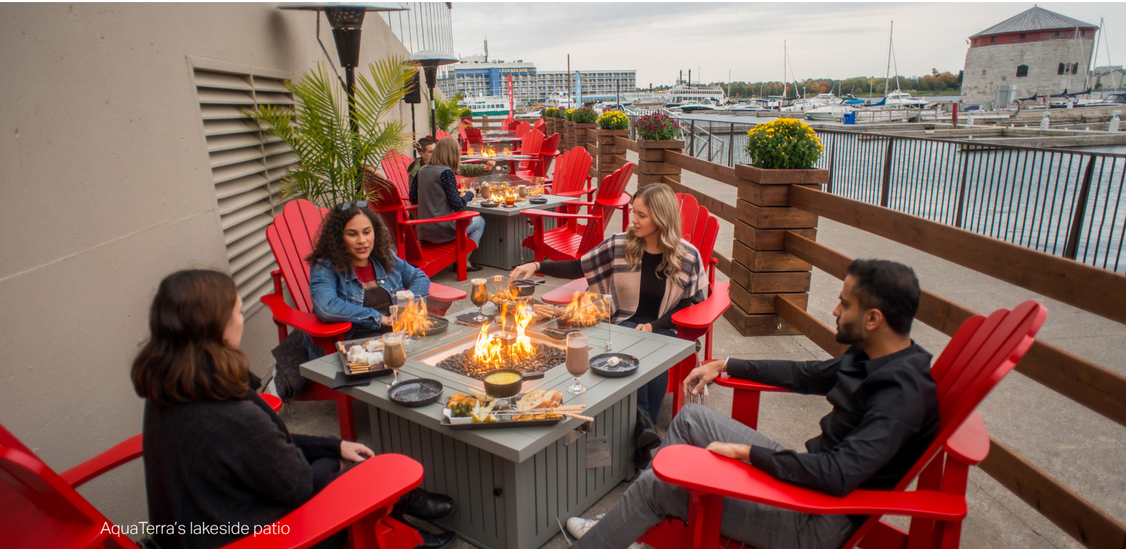
AquaTerra's lakeside patio

From historic inns to conference centres, Kingston has a venue to fit your business event. Our downtown accommodations are also in walking distance from several restaurants, cafés, and bars. So you have plenty of choices, whether you're organizing a dine-around for your conference attendees or looking for an oat milk latte and freshly baked muffin before you start your meeting.