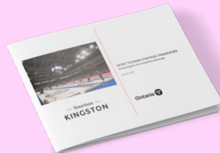
Sport Tourism Strategic Framework