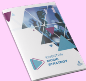
Kingston Music Strategy