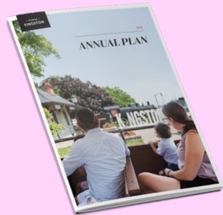
Tourism Kingston 2026 Annual Plan