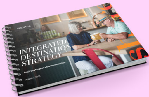
Kingston's Integrated Destination Strategy 3.0

Work each quarter is measured against a number of guiding documents, including: