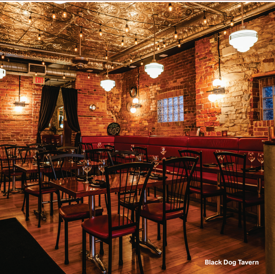
Black Dog Tavern