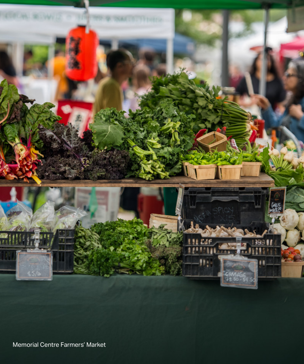
Memorial Centre Farmers' Market

Kingston is located in the heart of Frontenac County farmland. Frontenac farms feed Kingston tables, and Kingston chefs utilize fresh, seasonal ingredients from local growers and producers.