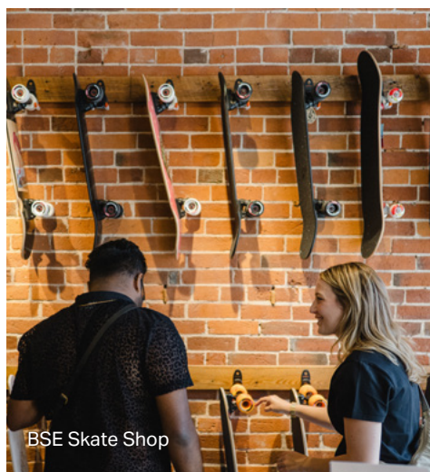
BSE Skate Shop