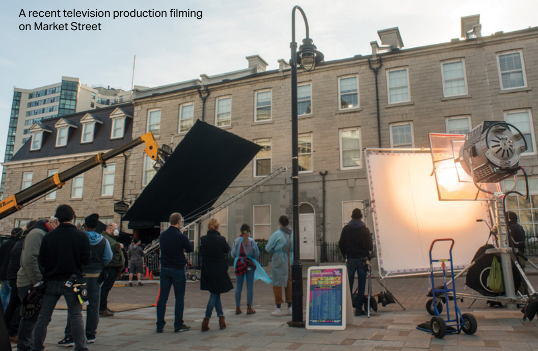
A recent television production filming on Market Street

Learn more: visitkingston.ca/walking-tours