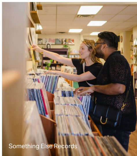
Something Else Records