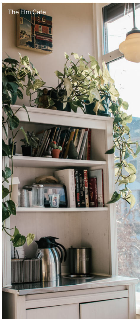
The Elm Cafe