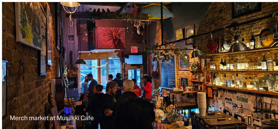
Merch market at Musiikki Cafe