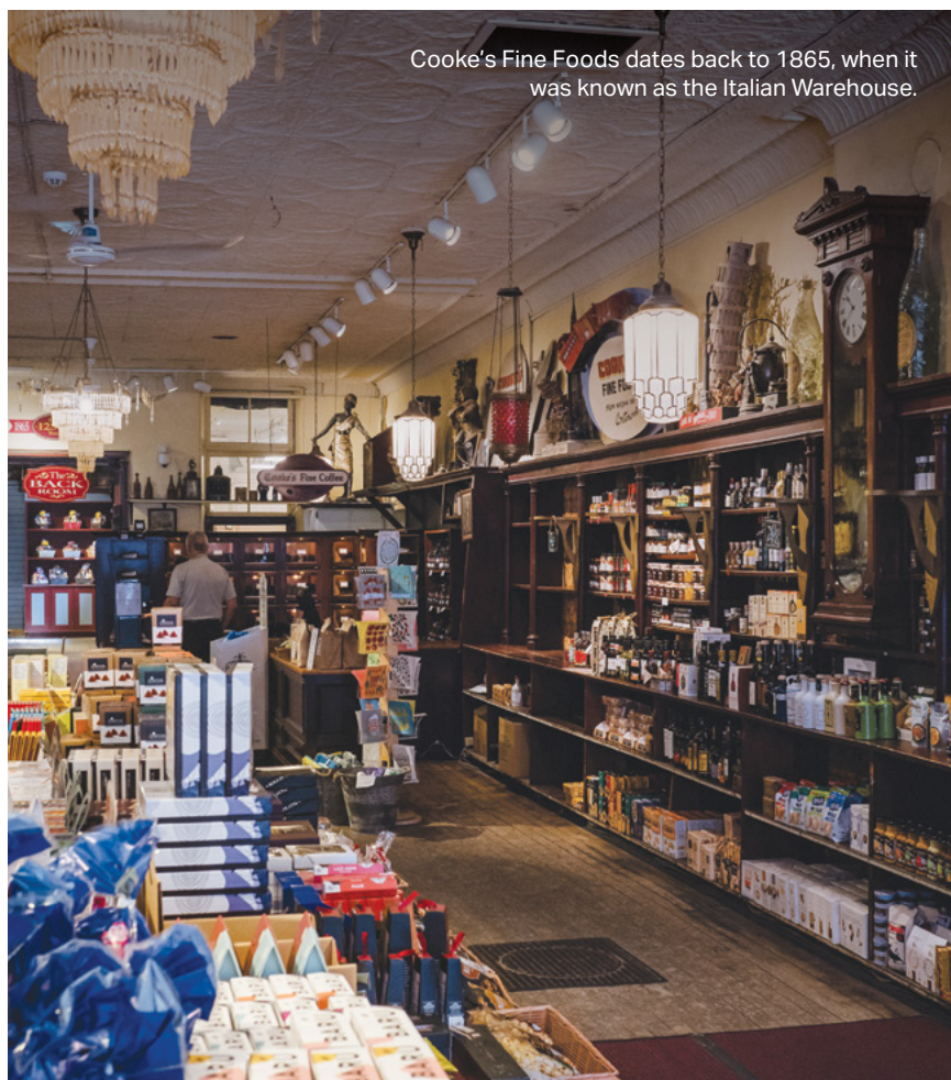
Cooke's Fine Foods dates back to 1865, when it was known as the Italian Warehouse.

Kingston's walkable historic downtown is full of unique shopping experiences, from antiques to apparel, food to fine art.