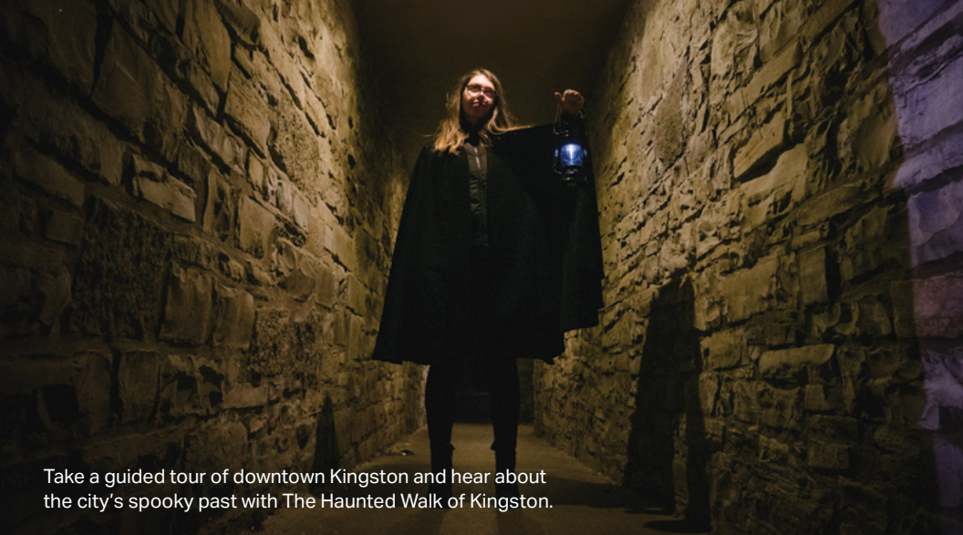
Take a guided tour of downtown Kingston and hear about the city's spooky past with The Haunted Walk of Kingston.

Kingston is home to more than 20 museums, national historic sites, art galleries, and archives. Explore geology, Canadian history, hockey, technology, medicine, and more. Enjoy hands-on learning with the kids or savour a quiet moment with a favourite painting.