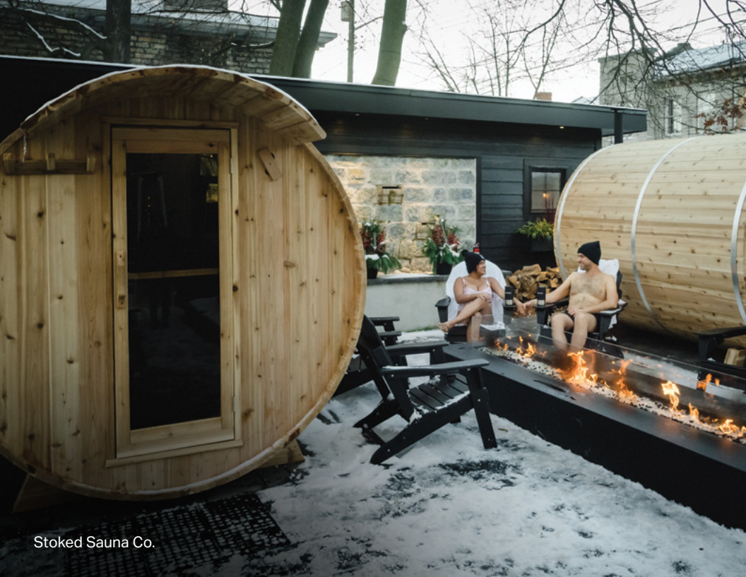
Stoked Sauna Co.

Plan a winter getaway in Kingston with a Stoked Sauna session, Kingstonlicious meal, or other special event.