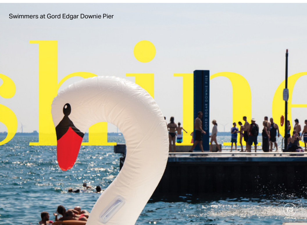
Swimmers at Gord Edgar Downie Pier